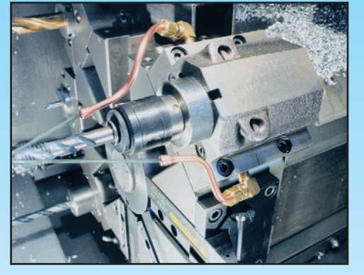
JetTubes shown on CNC turning center.

Ball: Stainless Steel Maximum Pressure: 500 PSI (33 bar) Maximum Operating Temperature: 160°F (70°C)